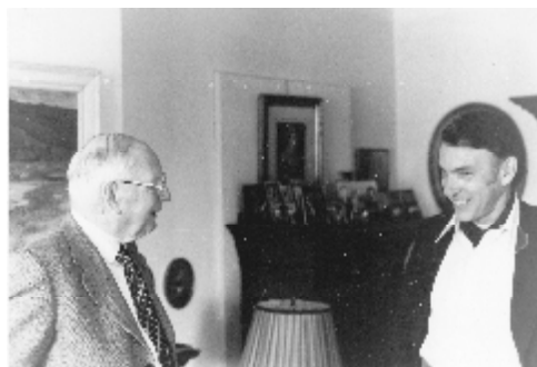
My father and I having a good laugh