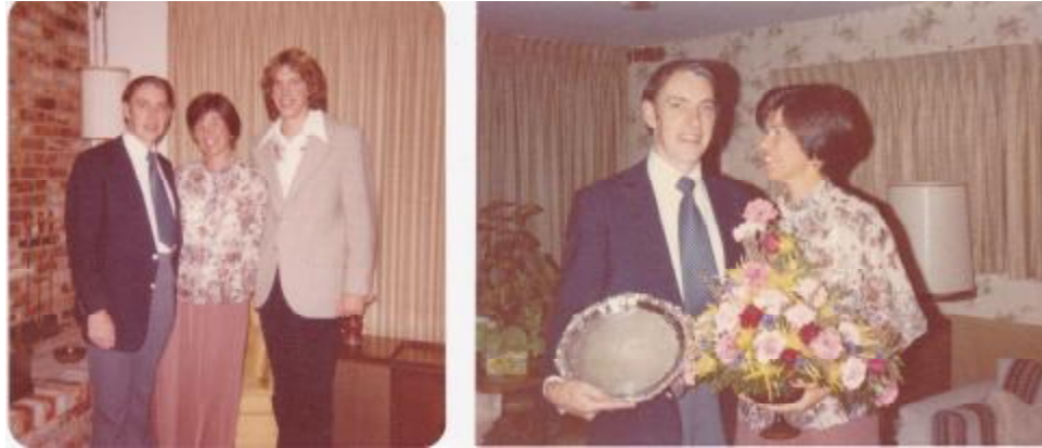
25 th wedding anniversary November 21, 1978