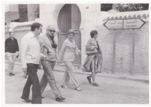
Walking towards the Kasbah in Morocco