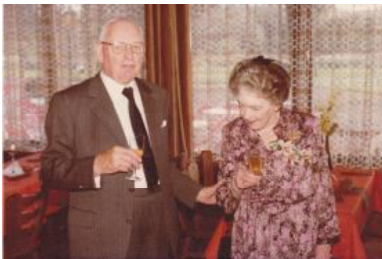
My mother listening intently to my father