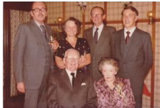
My parents and their 3 sons and one daughter in law.