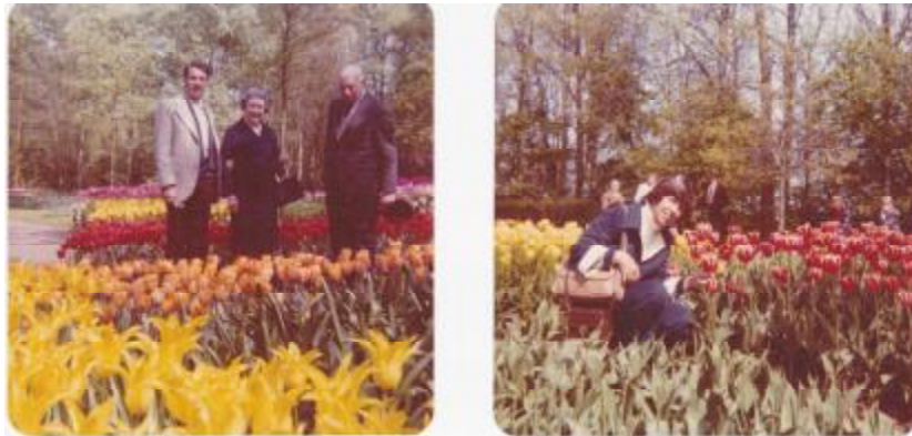
In het Keukenhof