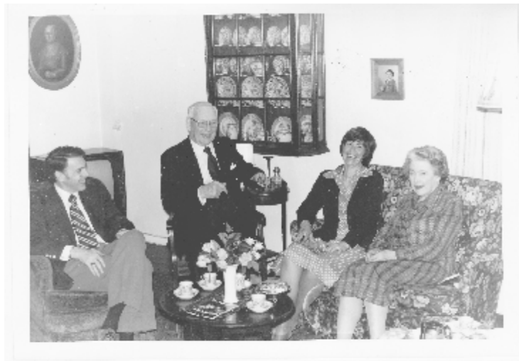
In my parents' living room