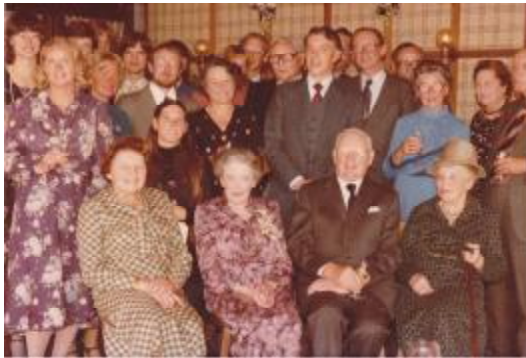
The entire group at the reception and lunch